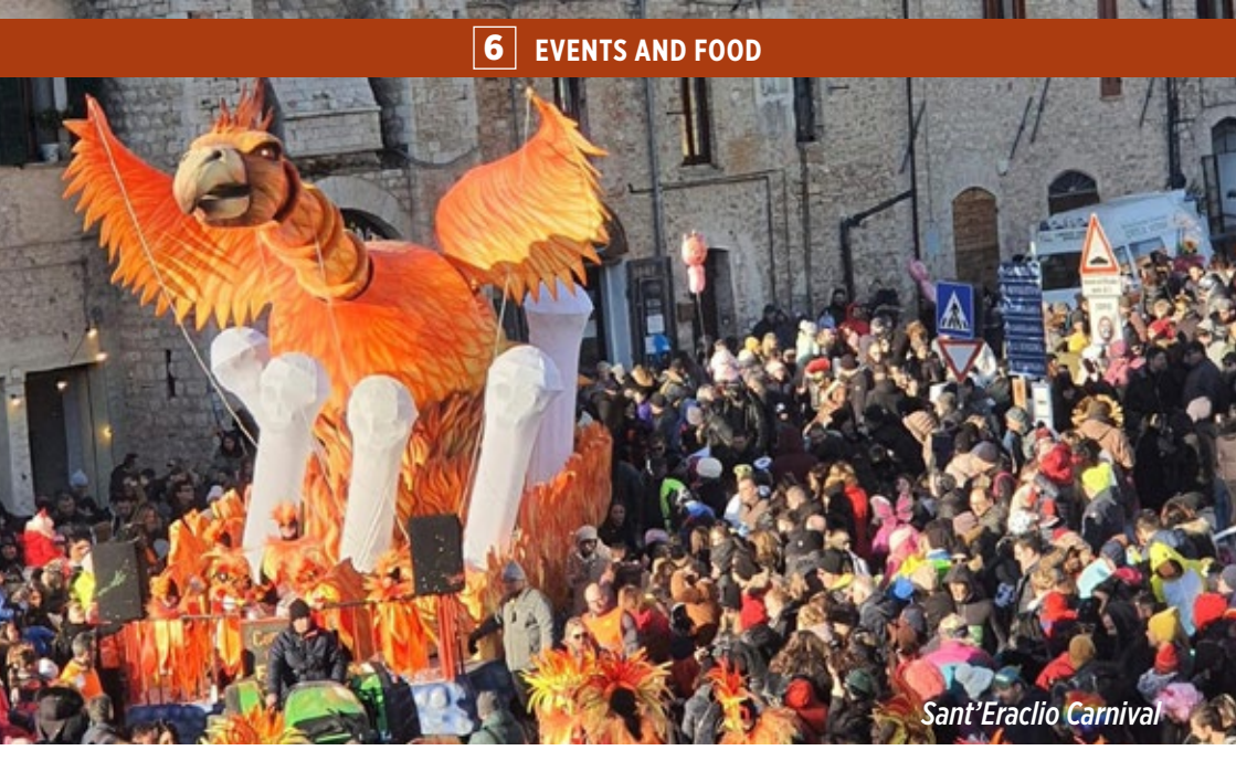
January - February